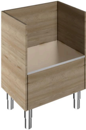
322113 (F32N0AF00W) Tray Dispenser, H=900mm